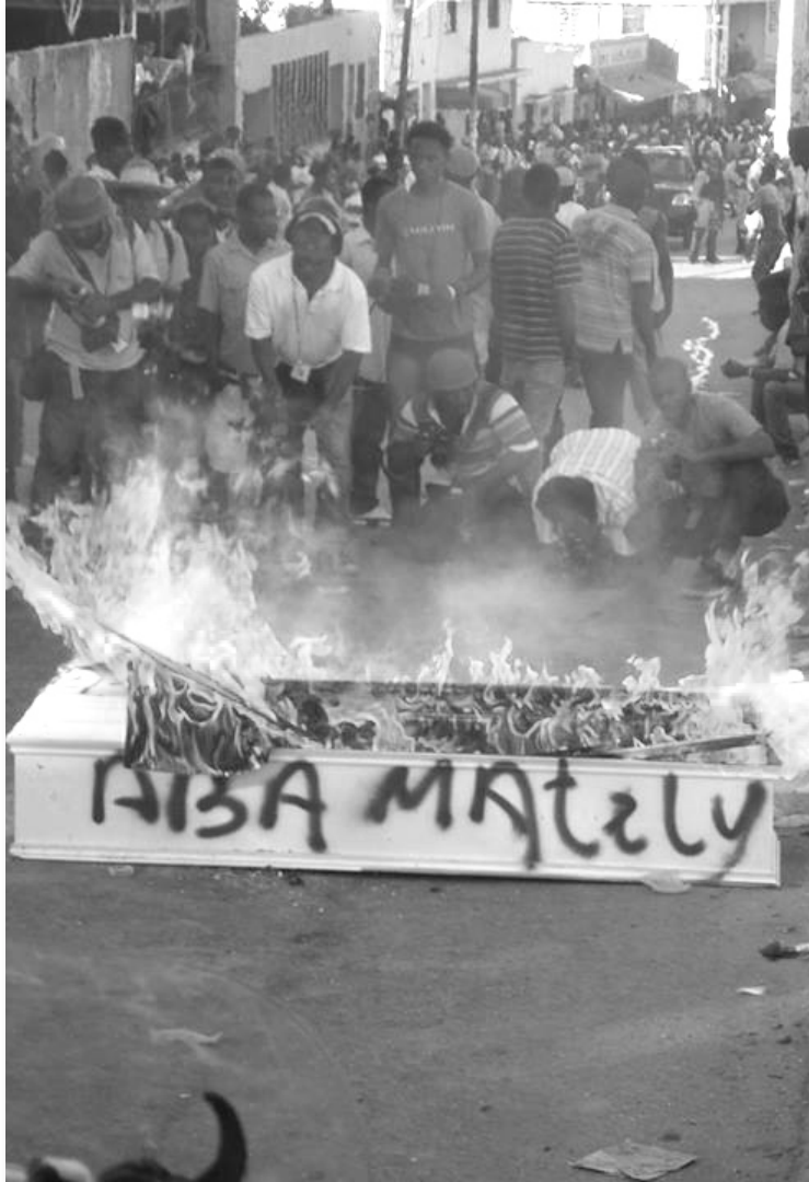
Demonstrators protest Michel Martelly.

the Aristide administration, which again received an overwhelming mandate in 2000. Following each coup—in 1991 and 2004—the US Government helped to install a military occupation to suppress resistance, namely, Lavalas . In 1991, the US lent its support to paramilitary groups, many of whom were part of the Duvalier military—since disbanded by Lavalas —and the Haitian police. In 2004, the US, with the support of France and Canada, threw its full weight behind the United Nations, which, in Haiti, is an occupying force, not a peacekeeping mission. Over the last 12 years, that occupation, known as MINUSTAH, has overseen the attempt to destroy Haiti's popular movement.