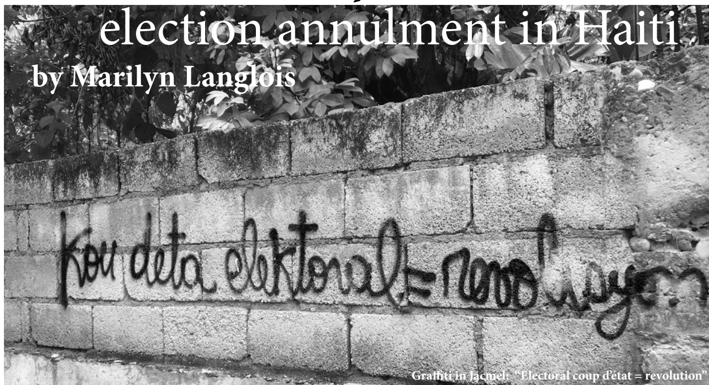
Graffiti in Jacmel: "Electoral coup d'état = revolution"

O n a visit to Haiti in late April 2016 with Task Force on the Americas, a California-based organization in solidarity with the social justice movements of Latin America and the Caribbean, we witnessed another example of Haitians resisting US attempts to facilitate continued looting of the country's resources and to sabotage its democracy.